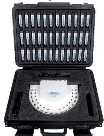
ATM2400 Data Acquisition Hub for USB Sensors

to obtain up to 100 data points. For surface temperature measurement, please refer to the UTS1000 Thermocouple Sensor datasheet. Humidity sensing is available with the UHS1000. UAS1000, UTS1000, and the UHS1000, can be used simultaneously with the ATM2400 data hub to obtain airflow, air & surface temperature, and humidity in one instrument.